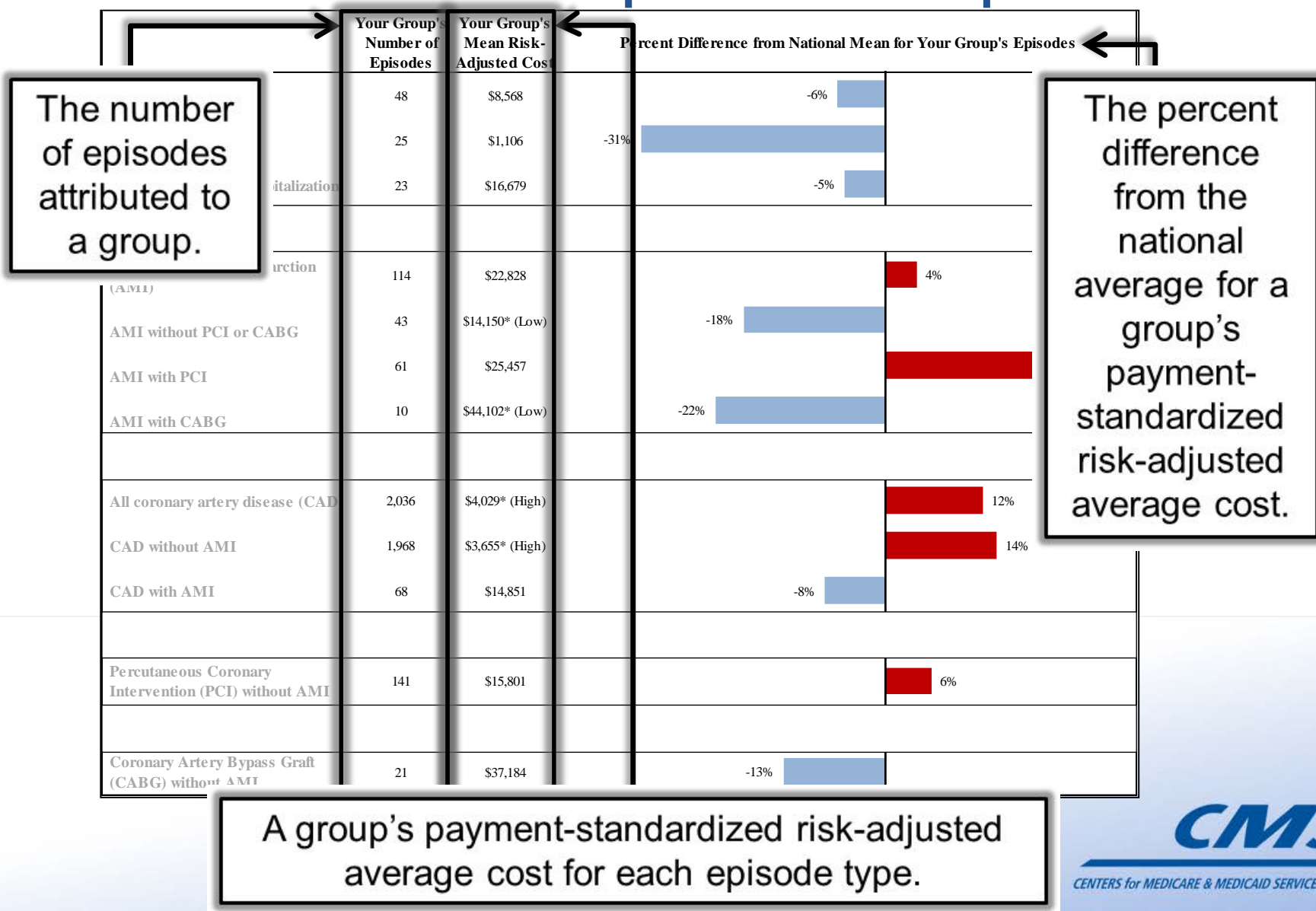
Exhibit 1 (1 of 2): Percent Cost Difference from National Mean for Your Group's Attributed Episodes