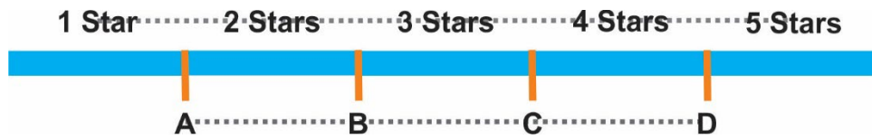
Figure K-2: Diagram showing star assignment based cut points.

Since higher is better for Medication Adherence for Diabetes Medications , a rating of one star is assigned to all MA-PD measure scores below 80% in this example. For each of the other Star Rating categories, the value of the lower bound is included in the rating category, while the upper bound value is not included. Focusing solely on the cut points for MA-PDs, a rating of two stars is assigned to each measure score that is at least 80% (the first cut point) to less than 85% (the second cut point) in this example. Since measure scores are reported as percentages with no decimal places, any measure score of 80% to 84% would be assigned two stars, while a measure score of 85% would be assigned a rating of three stars. Measure scores that are at least 85% to less than 87% would be assigned a rating of three stars. For a conversion to four stars, a measure score of at least 87% to less than 91% would be needed. A rating of five stars would be assigned to any measure score of 91% or more. PDPs have different cut points, but the same overall rules apply for converting the measure score to a Star Rating.