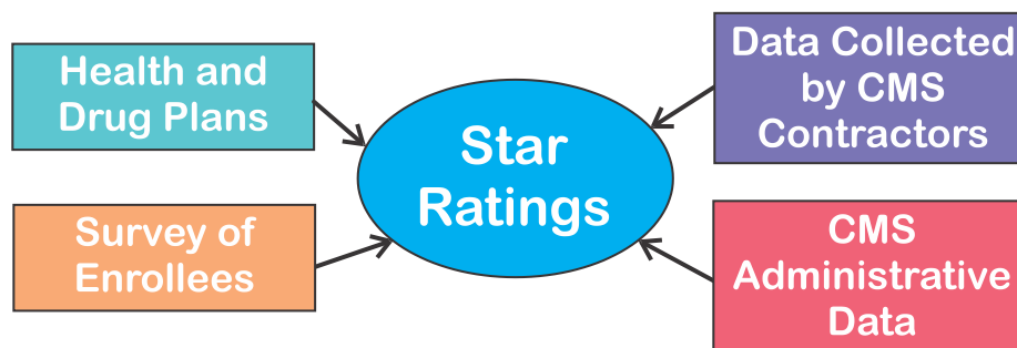
Figure 2: The Four Categories of Data Sources

The data used in the Star Ratings come from four categories of data sources which are shown in Figure 2.