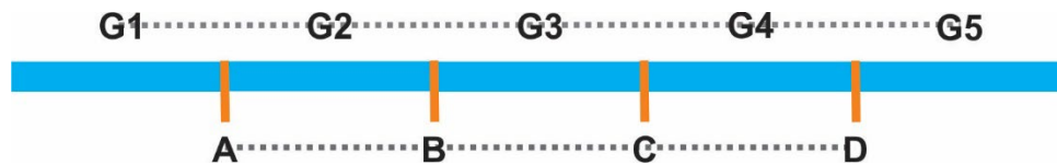
Figure K-1: Diagram showing gaps in data where cut points are assigned.

As mentioned, the cut points are used to create five non-overlapping groups. The value of the lower bound for each group is included in the category, while the value of the upper bound is not included in the category. CMS does not require the same number of observations (contracts) within each group. The groups are identified such that within a group the measure scores must be similar to each other and between groups, the measure scores in one group are not similar to measure scores in another group. The groups are then used for the conversion of the measure scores to one of five Star Ratings categories. For most measures, a higher score is better, and thus, the group with the highest range of measure scores is converted to a rating of five stars. An example of a measure for which higher is better is Medication Adherence for Diabetes Medications . For some measures a lower score is better, and thus, the group with the lowest range of measure scores is converted to a rating of five stars. An example of a measure for which a lower score is better is Members Choosing to Leave the Plan .