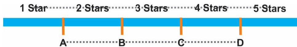
Figure J-3: Diagram showing star assignment based on cut points.